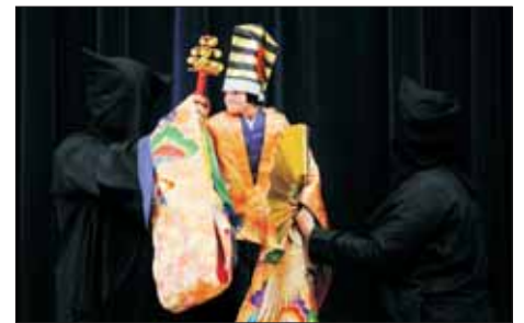
Puppets meld cultures and teach language