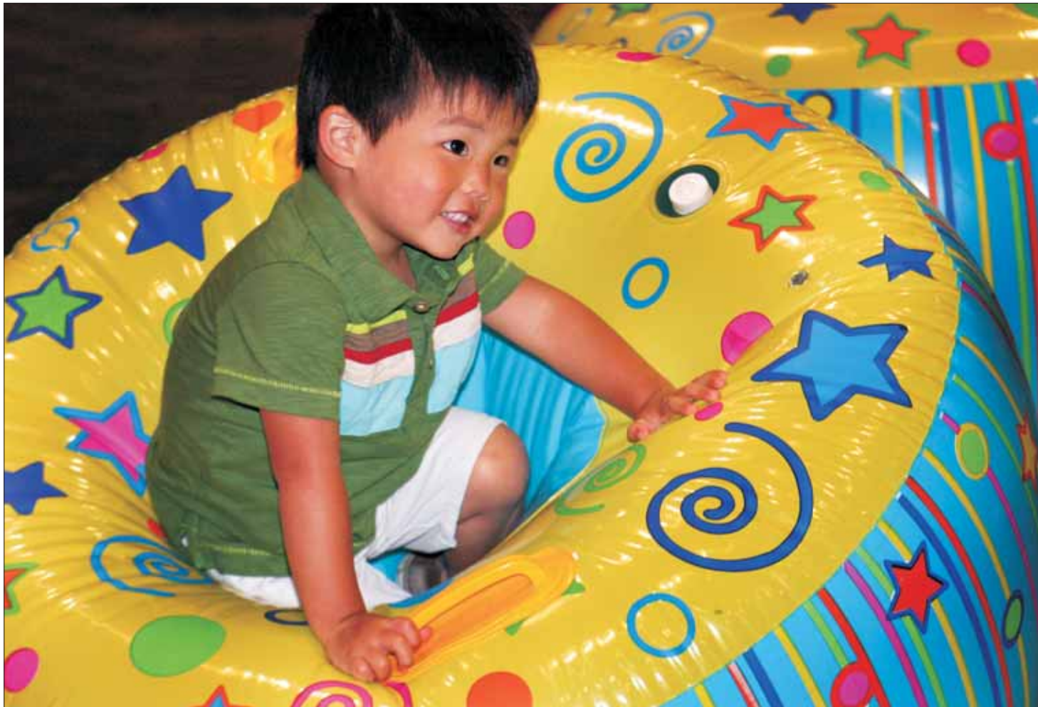
INFLATABLE FUN. The kids' area at this year's AsiaFest celebration included "body boppers" — inflatable donut-shaped toys with handles — and more. Held in celebration of Asian Heritage Month, the festival featured music, dance, cultural performances, a trivia challenge, arts-and-crafts and information booths, Asian cuisine, bubble tea, and more. Read about the sixth annual event on page 16.