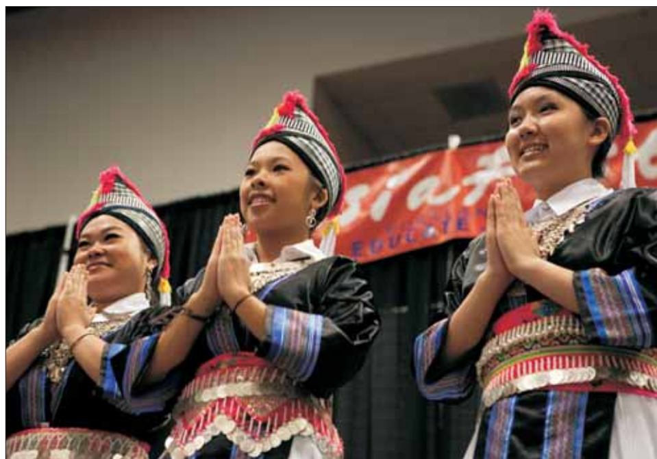
FACES OF ASIAFEST. The AsiaFest 2009 entertainment stage featured many performers, including (clockwise from top left) the Portland Art & Cultural Center Dance Team, the Hmong Sunflower Dancers, the Cambodian Dance Troupe, and the Natasinh Sao Lao of Oregon Dance Team. The Kids' Area was a popular destination for people of all ages. The area featured (counterclockwise from bottom left) a basketball shooting game; face, hand, and arm painting; crawl-through tunnels; art and craft activities; and more.