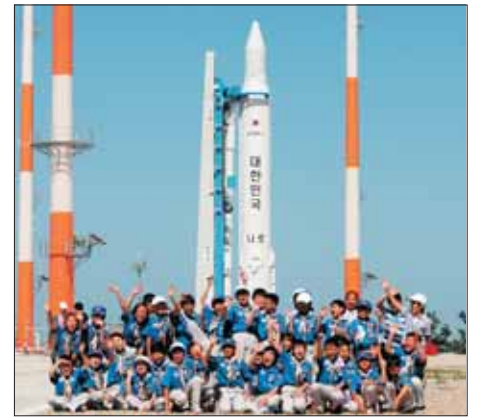
South Korea completes first space center