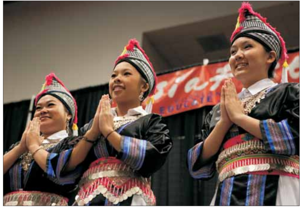
FACES OF ASIAFEST. The AsiaFest 2009 entertainment stage featured many performers, including (clockwise from top left) the Portland Art & Cultural Center Dance Team, the Hmong Sunflower Dancers, the Cambodian Dance Troupe, and the Natasinh Sao Lao of Oregon Dance Team. The Kids' Area was a popular destination for people of all ages. The area featured (counterclockwise from bottom left) a basketball shooting game; face, hand, and arm painting; crawl-through tunnels; art and craft activities; and more.